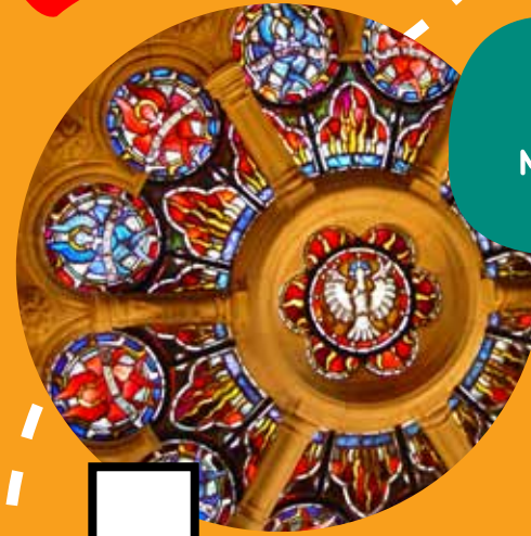
The Holy Dove Rose Window Made with brightly coloured glass