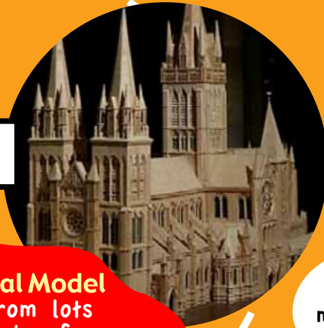
Cathedral Model Made from lots and lots of matchsticks!