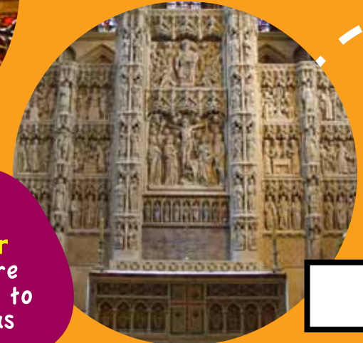
The High Altar Where we share bread and wine to remember Jesus