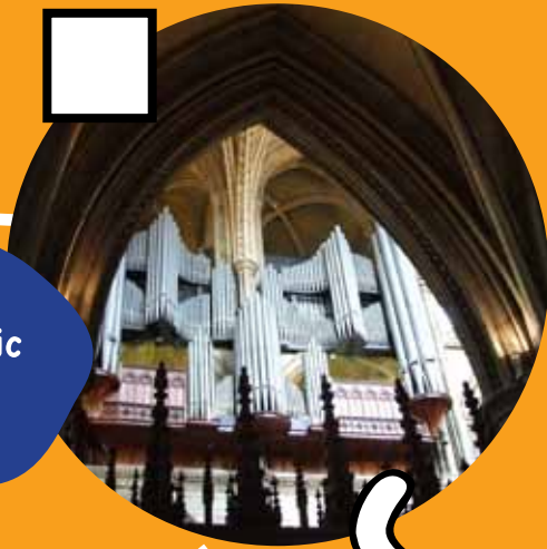
The Organ Where we play music to worship God